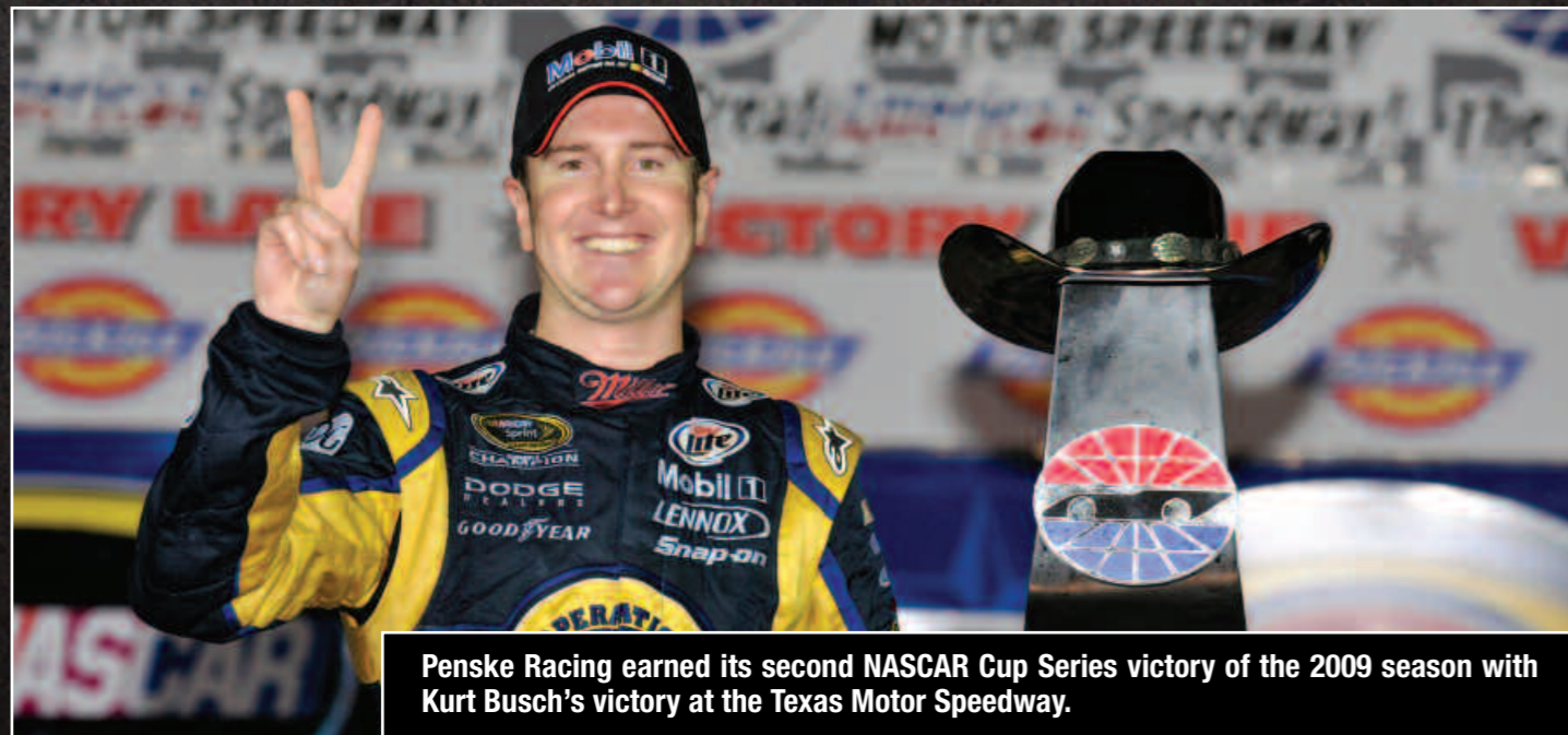
Penske Racing earned its second NASCAR Cup Series victory of the 2009 season with Kurt Busch's victory at the Texas Motor Speedway.