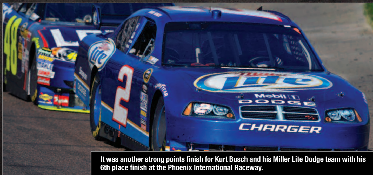
It was another strong points finish for Kurt Busch and his Miller Lite Dodge team with his 6th place finish at the Phoenix International Raceway.